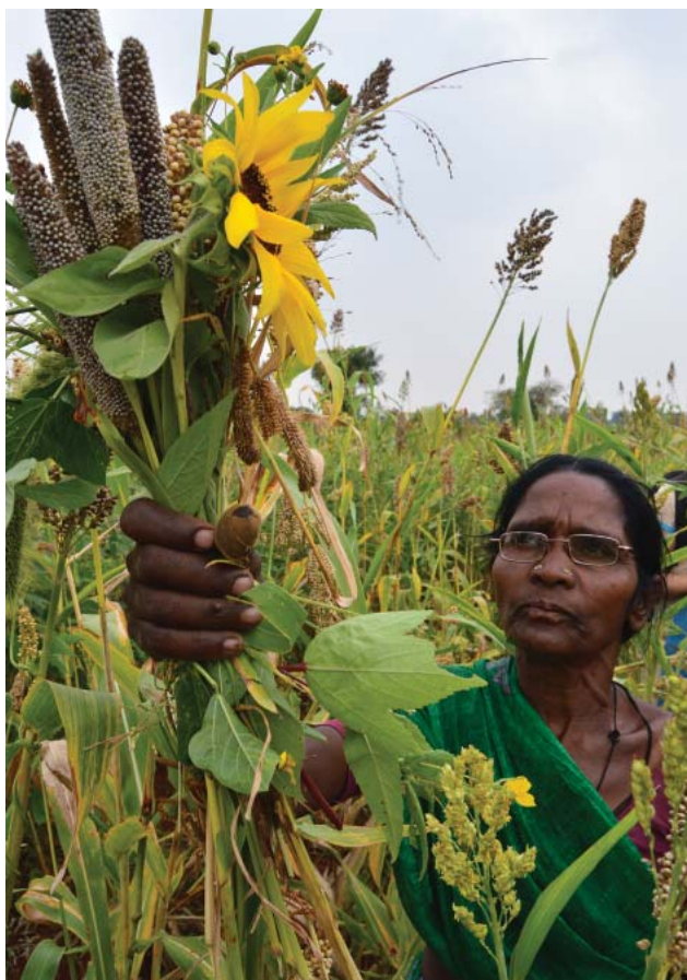
Deccan Development Society farmer with crop diversity, Andhra Pradesh, India.

► By 2020 areas under agriculture, aquaculture and forestry are managed sustainably, ensuring conservation of biodiversity.