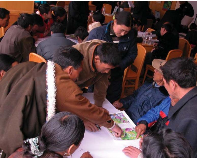
Planning forest ICCAs in Song Pan County, Sichuan, China.

In many (but by no means all) of these, the greater or special needs of women, the poor, or in other ways vulnerable sections of society are built into the governance and management practices. Where this was not the case in traditional systems, more recent changes brought in by exposure to new values of equity (e.g. on gender) are a feature of many ICCAs.