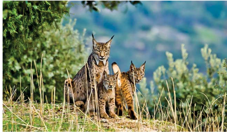
Iberian lynx in Dehesa, Spain.

ICCAs also incorporate significant local knowledge and practices that are crucial for an understanding of threats and needs of threatened species.