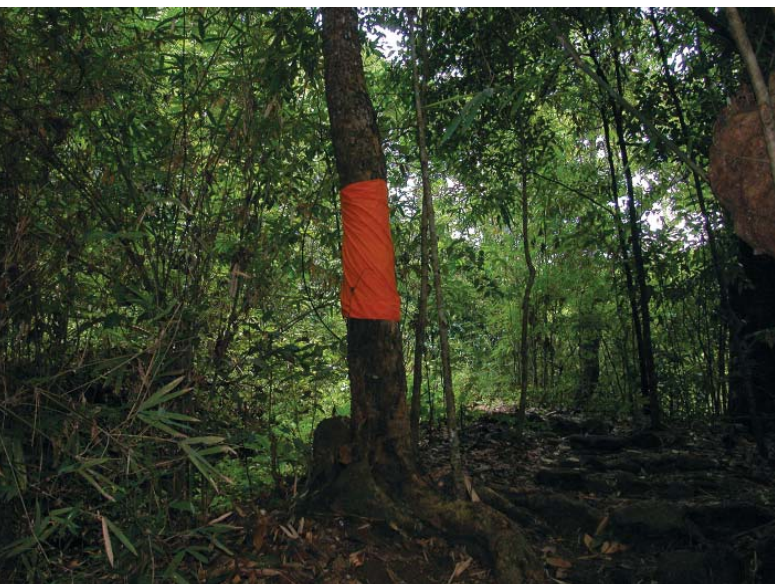
Sacred forest in Thailand.

Sites that can be considered ICCAs are strong candidates for recognition as areas and initiatives of conservation importance. This could be either as protected areas, or as 'other effective area-based conservation measures', but in all such instances any inclusion into an officially recognized system must be only after the free and prior informed consent (FPIC) of the relevant peoples or communities has been obtained.