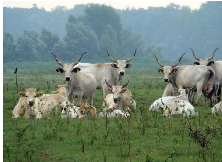
Podolian cattle on Gajina pasture, Croatia.

By 2015, the multiple anthropogenic pressures on coral reefs, and other vulnerable ecosystems impacted by climate change or ocean acidification are minimized, so as to maintain their integrity and functioning.