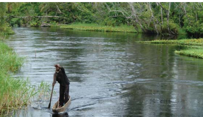
Man fishing in the Ndoki River

ICCAs incorporate systems of rules (written/unwritten, formal/informal), which are often a mix of disincentives (sanctions, penalties, etc. for violations) and incentives (ecosystem and economic benefits, awards, recognition, etc. for successful conservation / sustainable use). Where governments are recognizing ICCAs, there are often similar official systems of incentives and disincentives.