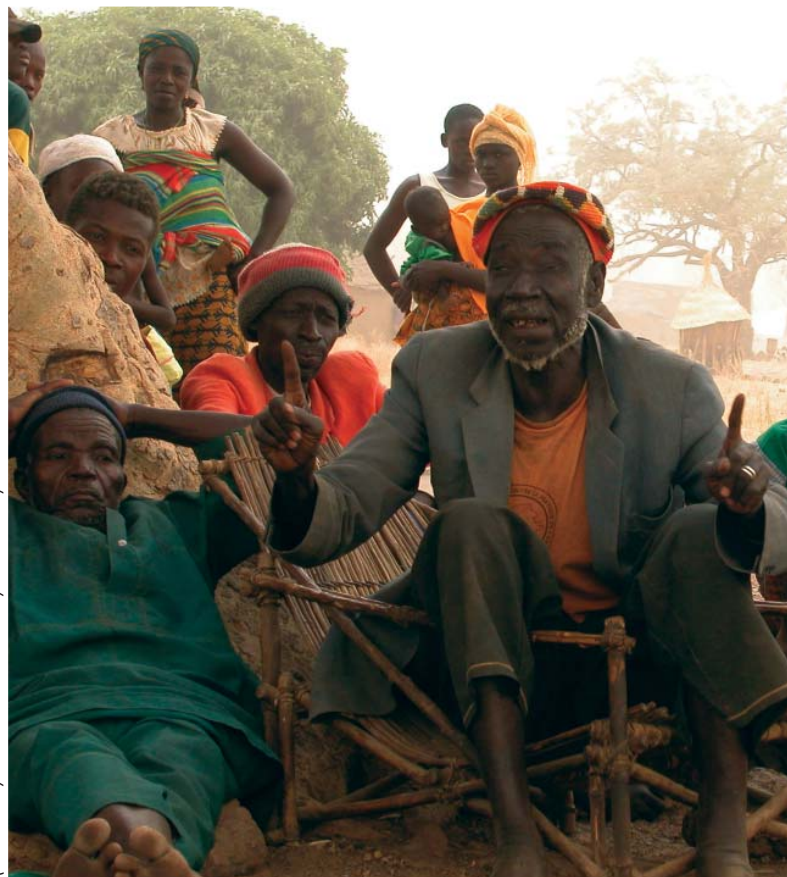
Explaining traditional conservation practices in Burkina Faso.

By 2020, the traditional knowledge, innovations and practices of indigenous and local communities relevant for the conservation and sustainable use of biodiversity, and their customary use of biological resources, are respected, subject to national legislation and relevant international obligations, and fully integrated and reflected in the implementation of the Convention with the full and effective participation of indigenous and local communities, at all relevant levels.