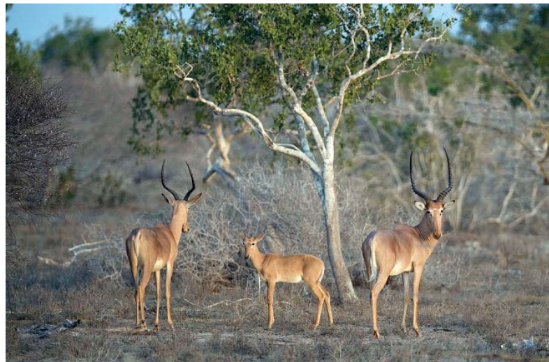
Hirolo antelope, Ishaqbini, Kenya.

managed protected areas. 36 Even in the coastal and marine environment, despite less visible recognition, the contribution of ICCAs is significant throughout the world.