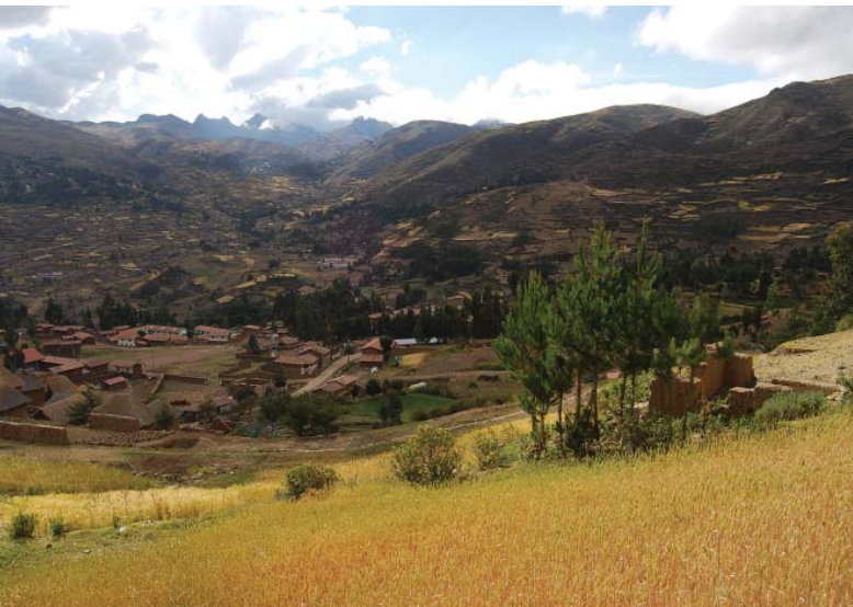
Parque de la Papa landscape, Peru.

In many parts of the world, conventional exclusionary protected areas have neglected or undermined such traditions and practices, leading to a loss of domesticated biodiversity and to knowledge relating to such diversity. In other areas, protected area strategies have actually taken on board domesticated diversity as either an explicit objective in its own right, or as a means of maintaining ecosystems that contain significant wild plant and animal diversity.