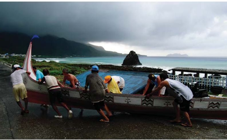
Traditional boat at Pongso no Tao, Taiwan.