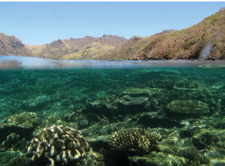
Waya Island LMMA, Fiji.

► Marine Areas for Responsible Fishing in Costa Rica seek to recognize fishers' rights to jobs, participation and a healthy and ecologically balanced environment. The definition of such an area is: "...an area with significant sociocultural, fishery or biological characteristics in which fishing is especially regulated to ensure long-term use of fishery resources and in which the INCOPECSA can count on the support of coastal communities and/ or other institutions for its conservation, use and management." For example, one of the decisions of the Tárcoles Marine Area for Responsible Fishing was to establish a one-year ban on shrimp fishing by trawlers, artisan shrimp fishing or net fishing over an area extending from the coast to a depth of 15 meters. Only hand line fishing was legal during this period. 22