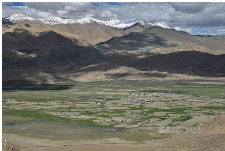
Hanle village and Indus river, Changthang

Ladakh is a vast, wondrous land —its enormous plateaus and lofty mountains traversed by rivers such as the mighty Indus and the Zaskar; its high-altitude-hardened pastoralists still very much the people of the earth; and its far-flung villages eking out a living by growing barley and smilingly surviving -40^{\circ} Celsius temperatures.