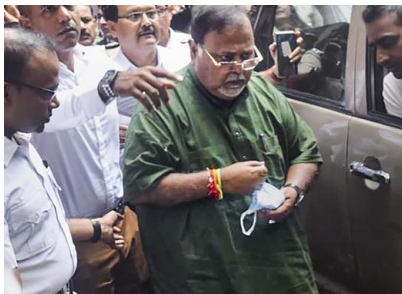
Trinamool Congress struggles to shake off corruption charges in Bengal