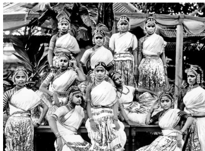
1947: Madras Devadasis (Prevention of Dedication) Act passed