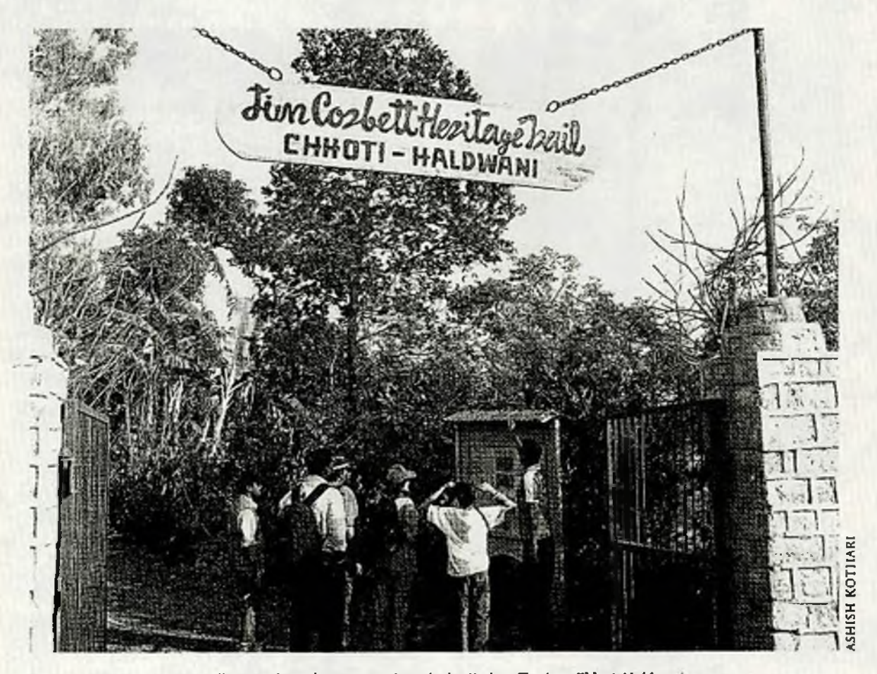
A village youth guiding visitors through the Corbett Trail in Chhoti Haldwani