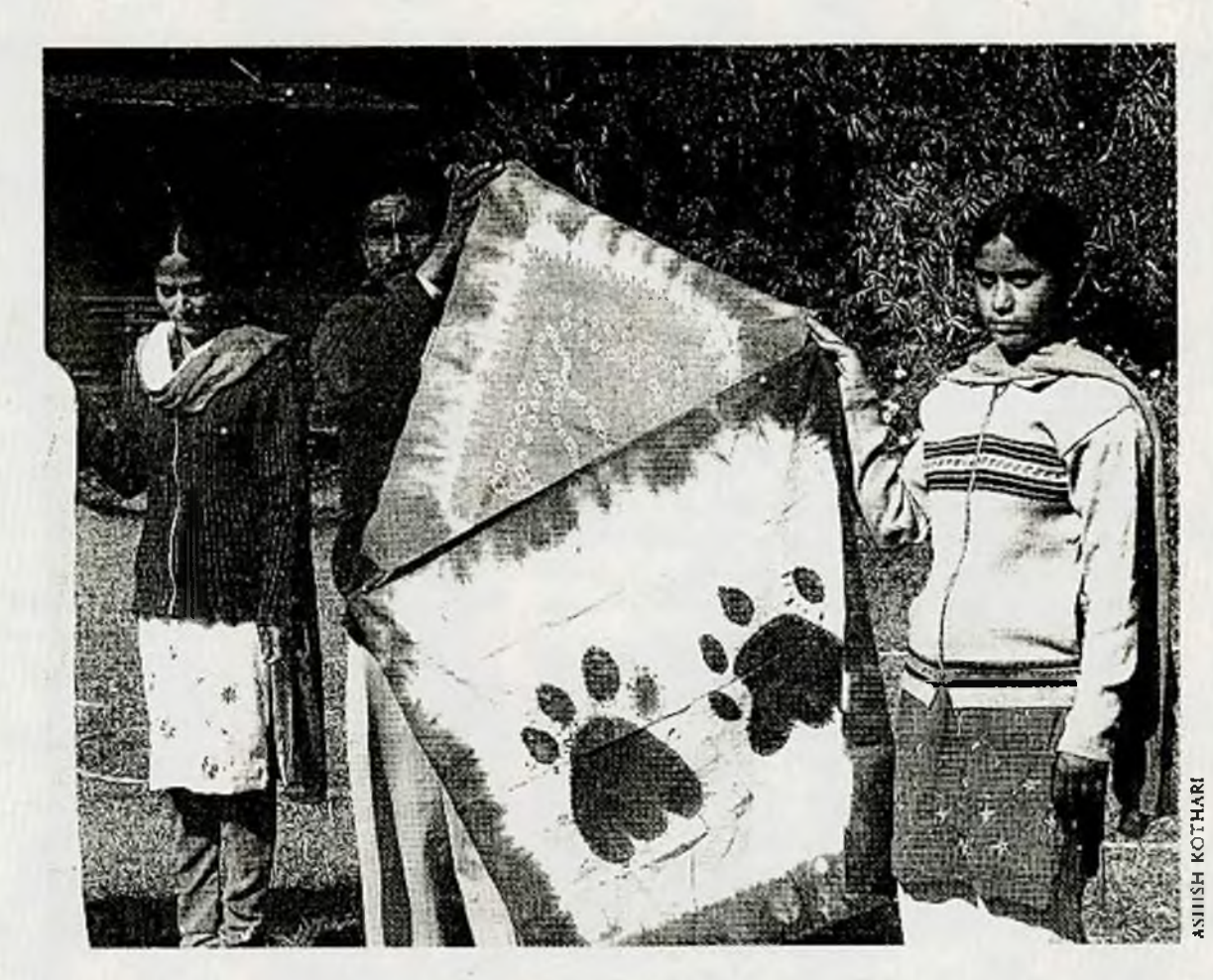
Tie-and-dye products of the women's group in Chhoti Haldwani

lped provide facilities. The the villagers,