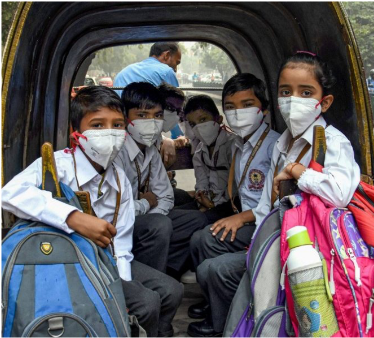
A few weeks ago, children in Delhi were wearing air pollution masks. Now they are being told to wear masks against the coronavirus.